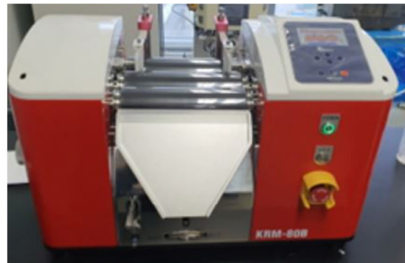
Three roll mill