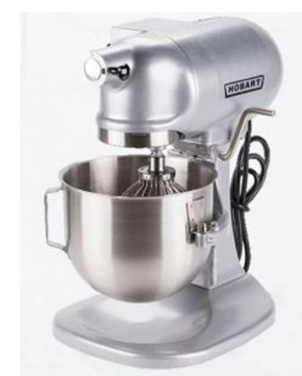
Hobart Mixer 5l, 20l