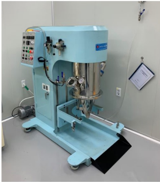
Planetary Mixer 200l, 20l