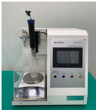
Liquid Dosing System