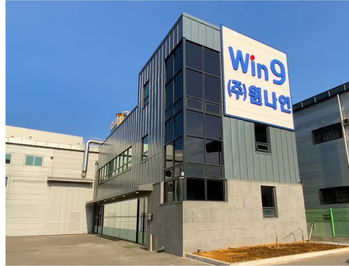
Win9 Co. Ltd / head office